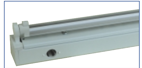
Replace with TubeSaver®