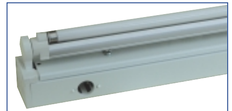
Fit new generation T5 tube

High Frequency High Power Factor Low Total Harmonic Distortion No Flickering No Wiring Cost