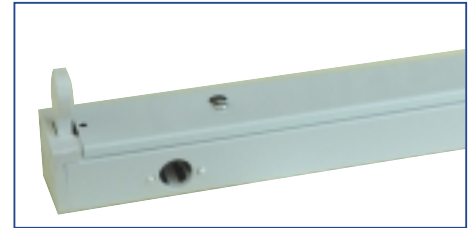
Remove tube and starter